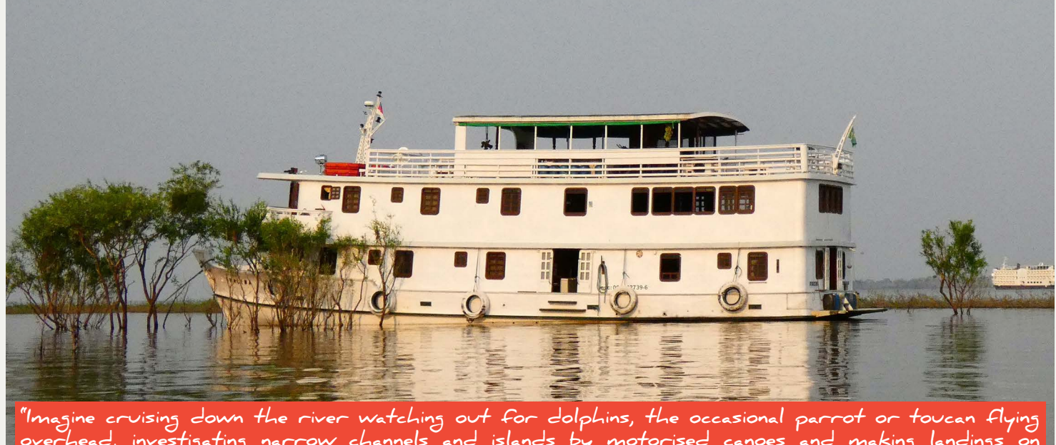
"Imagine cruising down the river watching out for dolphins, the occasional parrot or toucan flying overhead, investigating narrow channels and islands by motorised canoes and making landings on forested islands to see wonderful birds and spotting monkeys in the trees - it just sounds idyllic!" Roy Atkins